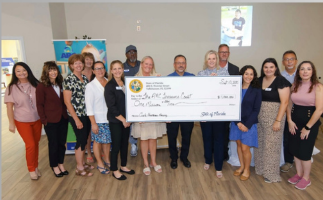
6 zeros for the win! $1,000,000 check to the ARC of the Treasure Coast!

The State of Florida and St. Lucie County were proud to contribute to the T.I.P (Therapeutic Intervention Program) at Ravenswood Lane in Port St. Lucie. The mission is to empower individuals with unique abilities by providing services for life skills, work and education. "Our community of individuals with unique abilities deserve to not only survive but to thrive".