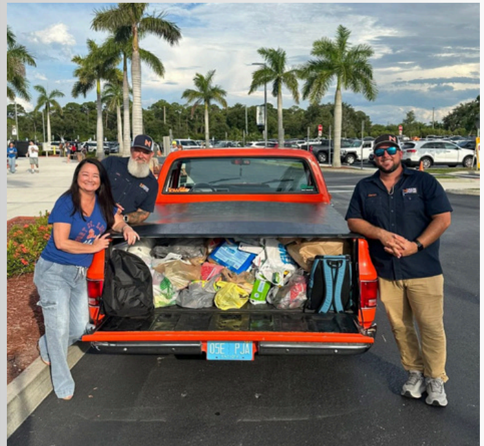
Thanks to your contributions, we collected a truckload of supplies for our teachers!