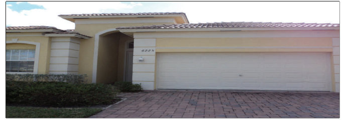
6225 Spring Lake Terrace $100,000 3 bedrooms, 2 baths, split floor .