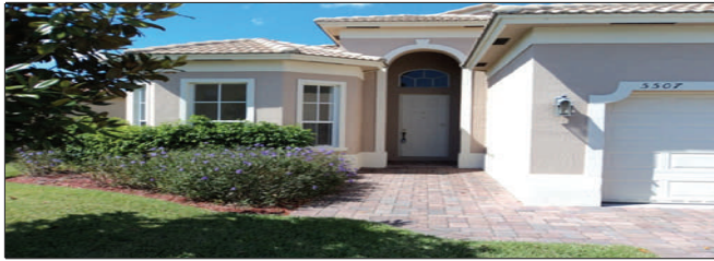
5507 Place Lake Drive $102,000 4 bedrooms, 3 baths, 2 car garage

The Portofino Shores subdivision is a gated/guarded community in North Fort Pierce. It features tennis courts, a pool, an exercise room, and clubhouse. This community also boasts beautiful lush landscaping, lakes, sidewalks, and is located next to Indian Pines Golf Course. This Mediterranean style community will make you feel like you own a piece of paradise.