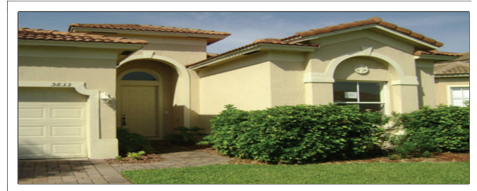
5833 Sunberry Circle $105,000 Waterfront View 3 bedroom, 2 bath, 2 car garage