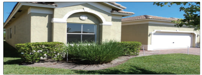
6200 Spring Lake Terrace $100,000 3 bedrooms, 2 baths , 2 car garage