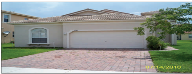
5640 Spanish River Road $100,000 3 bedroom, 2 bath, 2 car garage